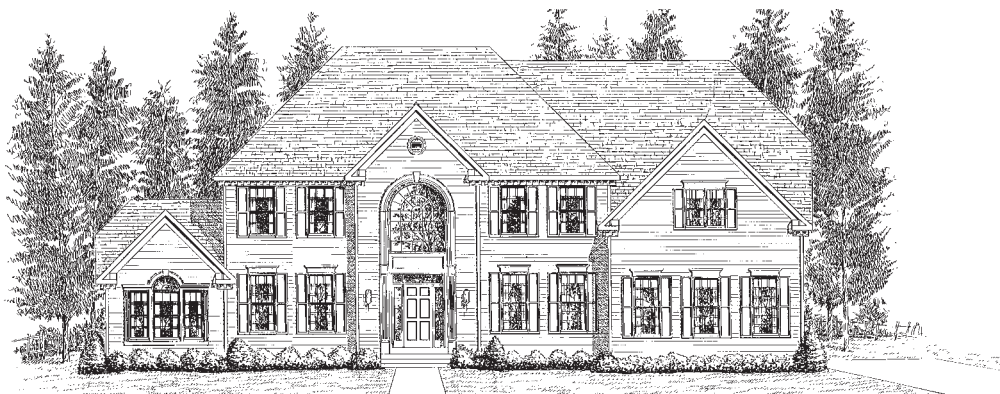
Elevation 2 Siding (Opt. Features Shown)