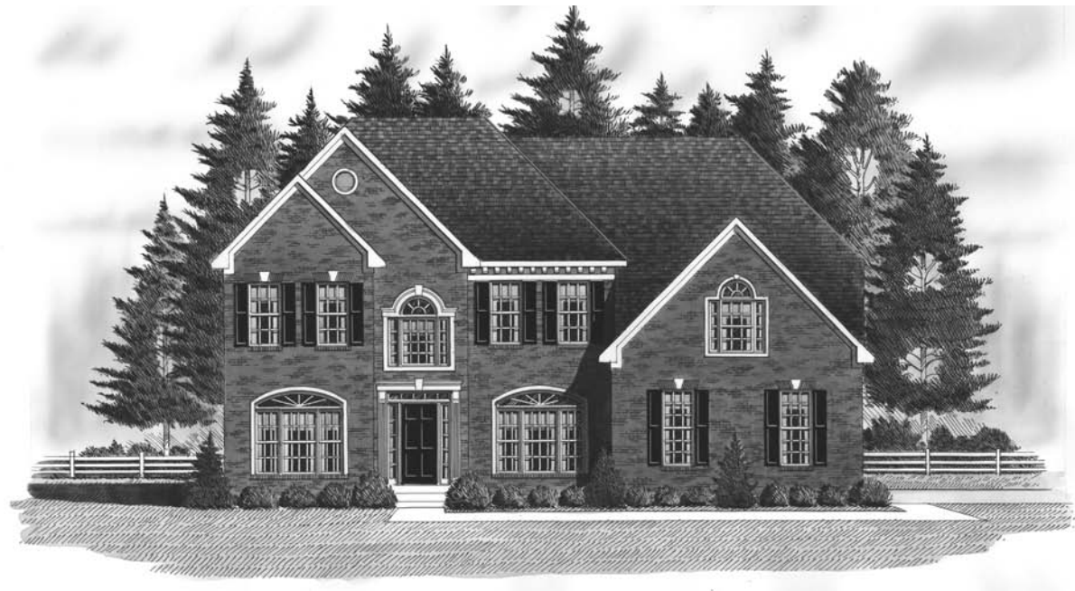
Elevation 2 (Shown w/ Opt. Brick Front & Hip Roof)