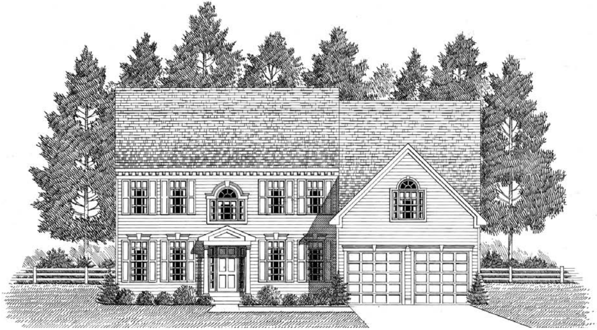
Elevation 1 (Standard)